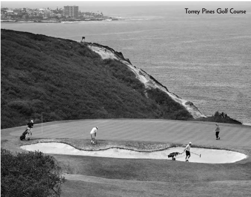
Torrey Pines Golf Course